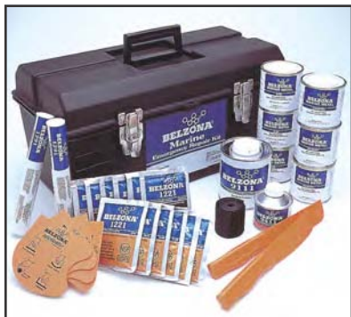
BELZONA MARINE EMERGENCY REPAIR KIT