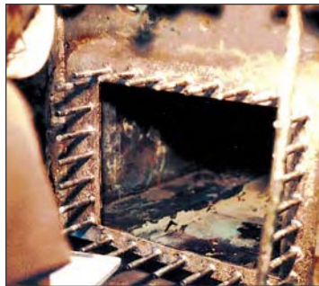
DISTORTED HEAT EXCHANGER FLANGE